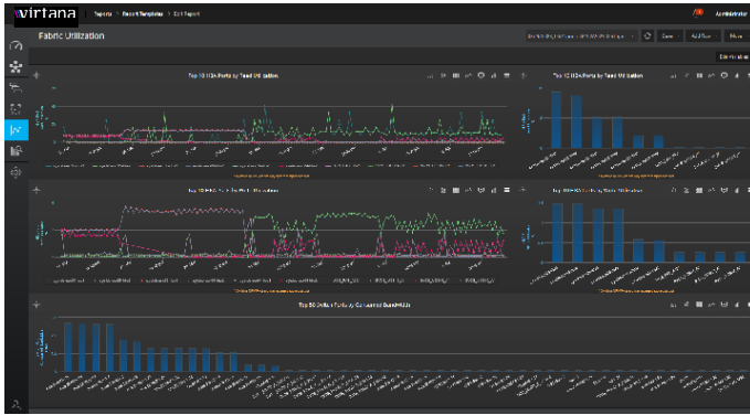
Figure 1: Insights from Virtana IPM monitoring a SAN compris and Cisco Fibre Channel switches