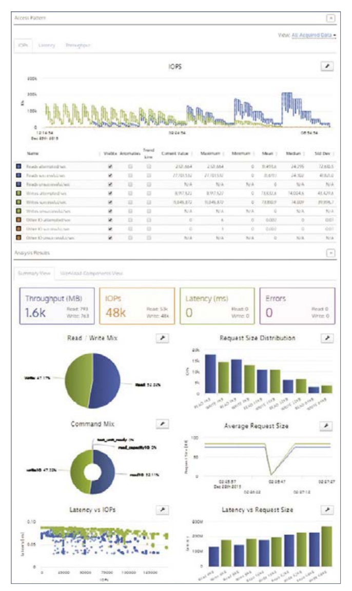
Figure 1: Virtana SLT Workload Analyzer module

The Command Mix graph tells us any command executed. This can even help in root cause analysis if unexpected commands are occurring. An example might be a 'mode sense' that bifurcates different latency figures.