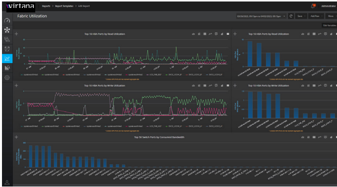
Figure 1: Insights from Virtana IPM monitoring a SAN compris and Cisco Fibre Channel switches