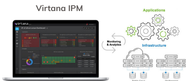
Figure 1: Single pane of glass view of compute assets onpremise and in the public cloud.

Virtana IPM WisdomPack for Operating Systems is part of the Virtana IPM full-stack hybrid infrastructure monitoring and analytics platform.