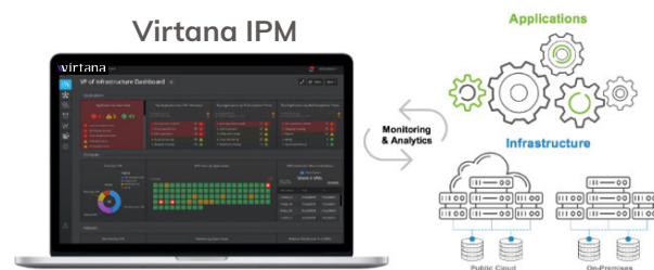
Figure 1: Single pane of glass view of compute assets onpremise and in the public cloud.

Virtana IPM WisdomPack for Enterprise Servers is part of the VirtualWisdom full-stack hybrid infrastructure monitoring and analytics platform.