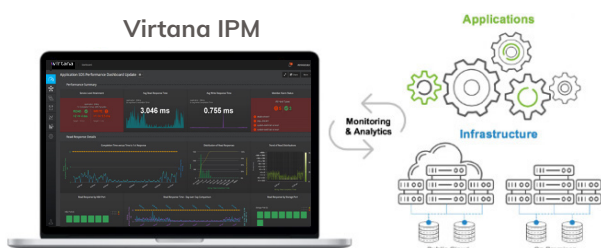
Figure 1: Single pane of glass view of compute assets onpremise and in the public cloud.

Virtana IPM WisdomPack for Enterprise Storage is a key building block of your full-stack infrastructure monitoring and analytics platform.