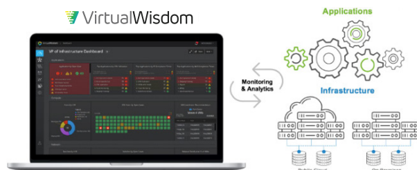
Figure 1: Single pane of glass view of compute assets on-premise and in the public cloud.

VirtualWisdom® WisdomPack for Enterprise Storage is a key building block of your full-stack infrastructure monitoring and analytics platform.