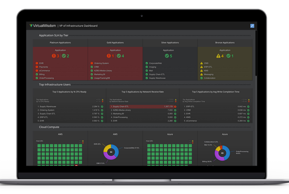
VirtualWisdom provides an application-centric view of the health of your entire hybrid infrastructure

Digital Transformation is fundamental to driving competitive advantage, whether it's through improved customer experience or more actionable business insights gained from analytics and machine learning. As a result, assuring the performance and accessibility of critical data infrastructure has never been more important.