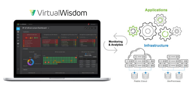
Figure 1: Single pane of glass view of compute assets onpremise and in the public cloud.

VirtualWisdom<sup>®</sup> WisdomPack for Enterprise Storage is a key building block of your full-stack infrastructure monitoring and analytics platform.