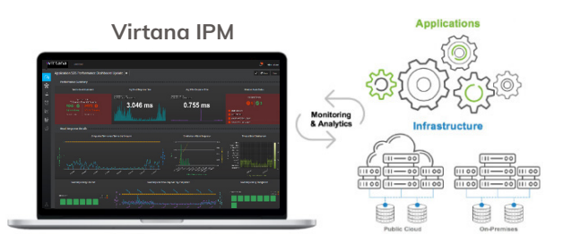
Figure 1: Single pane of glass view of compute assets onpremise and in the public cloud.

Virtana IPM WisdomPack for Enterprise Storage is a key building block of your full-stack infrastructure monitoring and analytics platform.